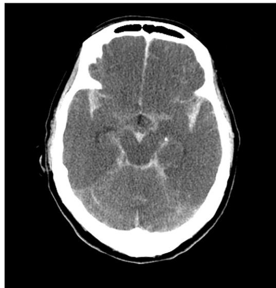
Fig. 1. Brain CT scan showed diffuse SAH.

Noninvasive monitoring such as transcranial Doppler ultrasound is used to measure the blood flow through the arteries, but ultrasound is an operator-dependent and noncontinuous tool. Continuous EEG monitoring is another useful noninvasive method for detecting delayed cerebral ischemia. Decreased \alpha/\delta ratio demonstrated strong association with delayed cerebral ischemia [2]. The