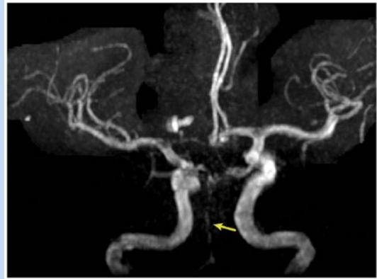
Figure 2. Magnetic resonance angiography image showing almost complete thrombosis of the basilar artery (arrow). This is an extension from the vertebral artery dissection and thrombosis.

Neurologic sequelae after an SVAD depend largely on the site of brain ischemia. Frequent patterns of ischemic brain damage are cerebellar infarction in the posterior inferior cerebellar artery territory and lateral medullary infarction. 4 Lateral medullary syndrome (Wallenberg syndrome) 11 can manifest as contralateral loss of pain and temperature sensation on the trunk with similar symptoms on the ipsilateral side of the face. 5 Other findings can include ipsilateral Horner syndrome as well as limb ataxia,