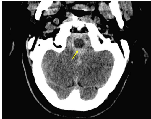
Figure 1 Brain CT scan demonstrating the presence of blood (arrow) in the pontine cistern surrounding the brainstem.

Despite urgent treatment and removal of most of the clot the patient remained with severe paraparesis, plegia on the right arm and mild paresis on the left arm. Two spinal MRI were performed, the first 2 weeks after surgery (figure 3A) and the second one 6 months later (figure 3B). Both failed to detect evidence of spinal tumours or signal voids that could suggest the presence of a vascular malformation. Taking these results into account and the absence of suggestive symptoms a catheter angiography was ruled out.