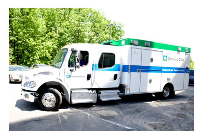
Fig 1. Exterior of Cleveland Clinic MSTU vehicle.

in the scanner, and immobilized. A single slice scan at the level of C1-C2 is performed. This scan serves as a reference to be used with a contrast tracking feature on the scanner. Contrastenhanced helical images are obtained, extending from the skull base through the Circle of Willis at 1.25 mm slice thickness. Eighty cubic centimeters of Optiray 350 is injected at a rate of 4 cc/second using a single lumen Liebel-Flarsheim Optistat injector. Technical parameters include tube current of 7 mA, peak kilovoltage of 120 kVp, at a pitch of 1. Images are transmitted to the vascular neurologist and radiologist for review. Once the CTA is obtained, images are transmitted to the vascular neurologist and neuroradiologist. The vascular neurologist interprets the images and is able to make treatment decision based on it. The neuroradiologist also provides an official read of the imaging.