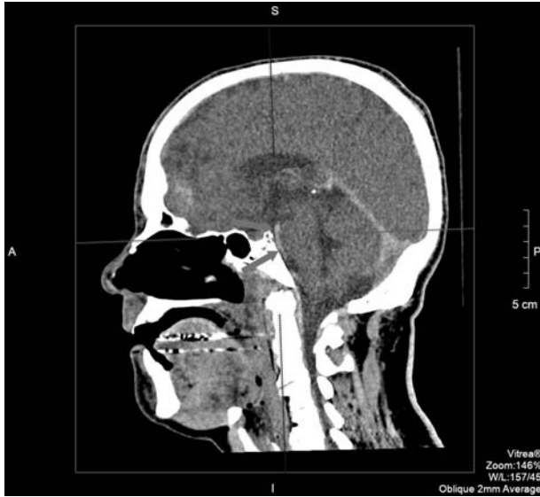
FIGURE 1. Unenhanced PMCT of the head showing a hyperdense basilar artery (arrowheads, Hounsfield units: 65 \pm 10 HU) on sagittal view.

artery and subsequent microscopic evaluation. 9,10 In the antemortem setting, a diagnosis is made via CT scan, of which the key finding is hyperdensity of the basilar artery. 1,4,5 There is limited information in the literature on the PMCT findings of basilar artery thrombosis.