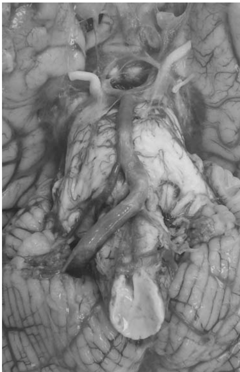
FIGURE 2. Photograph of the base of the brain showing thrombosis of the intracranial segment of the right vertebral artery and full length of the basilar artery.

Postmortem CT is becoming an increasingly used adjunct to autopsy in many forensic pathology departments, and its place in forensic pathology is still being explored. A major role of the