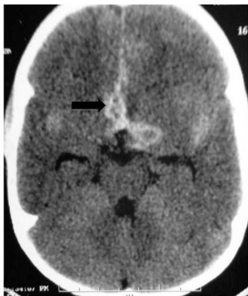
Fig. 1 CT head (axial) at the level of basal cisterns showing subarachnoid hemorrhage (arrow)

on manual ventilation; however he succumbed to his illness. Cerebrospinal fluid analysis (post mortem) was normal. Cerebrospinal fluid (CSF) analysis for mycobacterium tuberculosis (polymerase chain reaction, PCR), cryptococcus (India ink staining), herpes (PCR) and fungus (microscopy) was negative. Toxoplasma IgM and IgG antibodies were negative by ELISA. Blood and urine cultures were sterile. Postmortem lung biopsy did not show any granulomas or acid fast bacilli. Human Immunodeficiency Virus (HIV) ELISA was positive during the current illness. Both parents were also diagnosed as HIV positive subsequently.