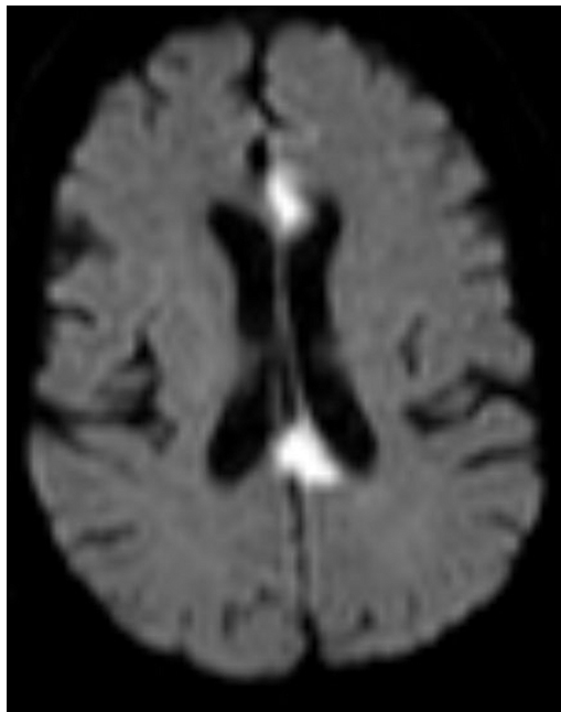
Figure 1 Axial MR diffusion-weighted imaging sequence showing restricted diffusion affecting the genu and splenium of the corpus callosum.

In this patient, the traditional risk factors described above were aggressively managed and antiplatelet medication was prescribed.