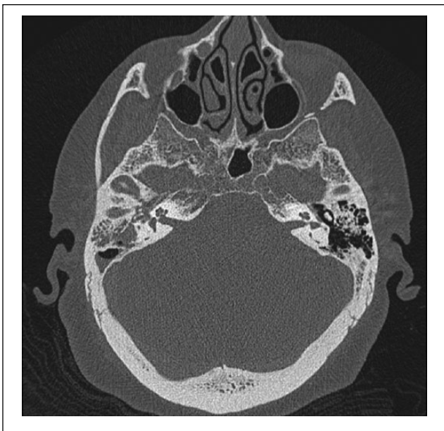
Figure 1. Contrasted computed tomographic axial image of temporal bones, showing an opacified right mastoid and middle ear cavity with ossicles in place.