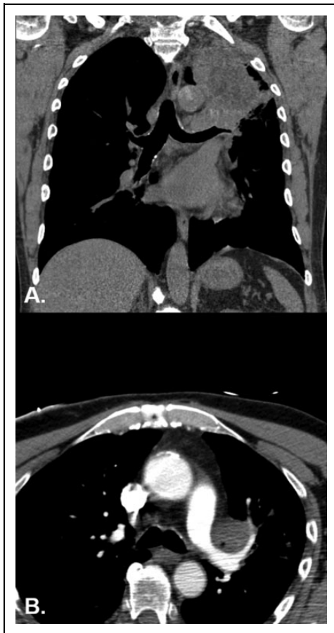
Figure 1. A, Computed tomography (CT) of the chest showing a 6.8 \times 6.1 \times 9.2 cm soft tissue mass in the left upper lobe extending to the left hilum and abutting the left main pulmonary artery. B, Axial image from a contrast-enhanced CT angiogram of the neck demonstrating encasement and narrowing of the left main pulmonary artery by the left hilar mass.

expedited bronchoscopy was performed on the following day of presentation with findings of a fungating mass eroding from the posterior aspect of the left upper lobe takeoff obliterating everything except the lungula. A staging CT of the abdomen and pelvis was also obtained, which additionally demonstrated a lytic lesion in the T10 vertebral body, a 2-cm hypodense lesion involving the lateral aspect of the interlobar left kidney, and a stable 1.1-cm hypodense lesion in the lateral aspect of the interlobar right kidney with an indeterminate hepatic hypodense lesion.