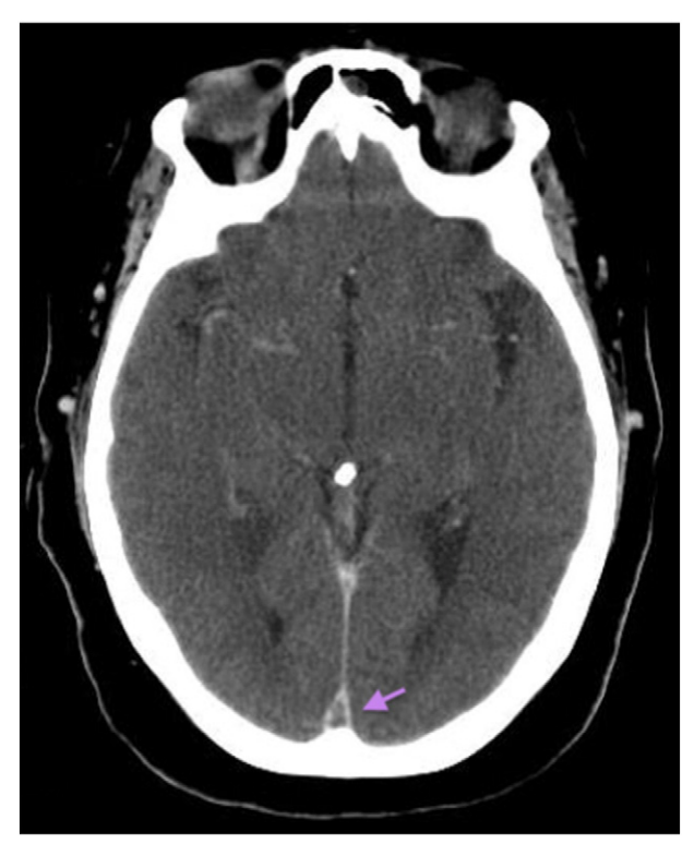
Fig. 1. Computed tomography scan showing an empty delta sign [5] Empty delta sign of dural venous sinus thrombosis within the superior sagittal sinus on contrast enhanced CT.

P. Khatib et al. / American Journal of Emergency Medicine xxx (2016) xxx-xxx