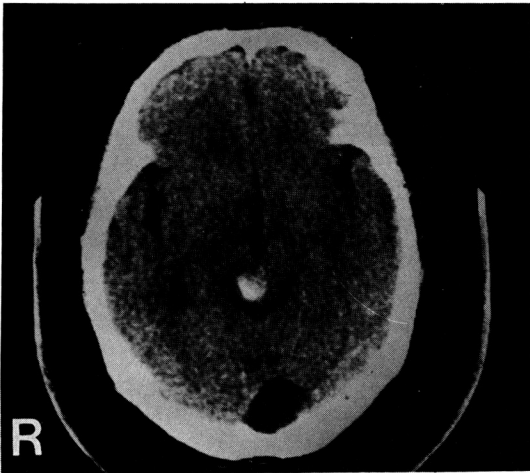
Fig. 1. CT demonstrates an area of hemorrhage in the dorsal midbrain lateralized to the right.

The result of coagulation study and blood ammonia level was normal. A computed tomographic (CT) scan performed 4 days later disclosed a small non-enhancing hematoma, approximately 1.5cm in size, in the dorsolateral midbrain at the collicular level on the right side (Fig. 1). During the subsequent week,