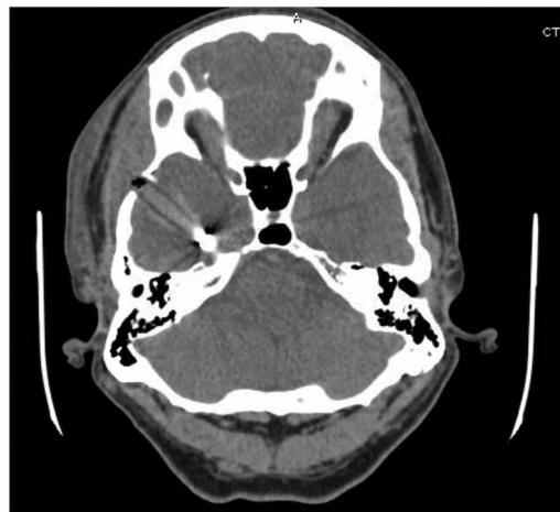
Figure 2 CT images showing penetrating foreign object consistent with a 2 cm broken pen tip and 4.1 cm radiolucent object extending through the anterior right middle cranial fossa and into the right temporal lobe parenchyma with associated pneumocephalus and intraparenchymal haemorrhage.

the tip just above the right petrous apex. Metallic streak artefact limits complete evaluation of the surrounding tissue; however, there is suspect mildly displaced fracture of the petrous apex. No evidence of arterial intracranial vascular injury.