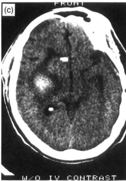
FIG. 1(a) The brain CT scan performed on admission showing a large, primarily intracerebral haemorrhage located with its centre in the right putamen. There is marked mass effect with effacement of the suprasellar and quadrigeminal plate cisterns. (b) A repeat CT scan performed approximately 24 h later after the patient's condition deteriorated. From this scan, the diagnosis of impending transtentorial herniation was made. (c) Follow-up CT scan obtained five weeks after initial presentation.

recognition of persons and objects, a pattern of oral exploration, hyperbulimia, alteration of sexuality, and stereotyped motor mannerisms. In addition, the patient exhibited memory difficulties. In most other reports of human KBS, there is only partial expression of the syndrome. For example, in the paper by Lilly et al. 6 , cases were included if they manifested simultaneously, a minimum of only three KBS elements. Our patient appears to exhibit the full syndrome.