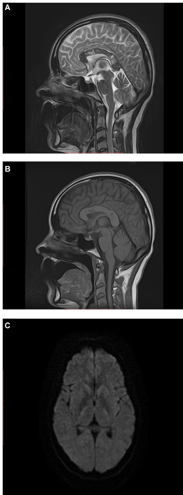
Fig. 1 – MRI revealed the presence of snowball lesions in the corpus callosum (A) - FLAIR, punched out holes in the corpus callosum (B) - T1, strings of pearls in posterior part of the capsula interna (C) - DWI.

A 29 year old, right-handed woman began to suffer from migraine-like headaches in June 2015. According to the family interview, after a few weeks a progressive cognitive decline, behavioral disturbances (personality changes, apathy) as well as subacute hearing loss, tinnitus, dizziness, vertigo, visual blurring, fatigue, dysarthria, unsteady gait, ataxia, leg weakness and falls appeared. A few weeks later, double vision, further hearing loss and dysphagia occurred. The patient was hospitalized in a neurology department. Neurological examination revealed preserved consciousness, full auto- and alloorientation, central nerve VII right paresis, slight hearing loss bilaterally, slight spastic paraparesis of low extremities (more pronounced on the right side – 4 points in Medical Research Council scale for muscle strength (MRC scale), Babinski sign on the right side, gait instability and visual acuteness twenty twenty (correct). Two months since the first disease symptoms, final diagnosis of encephalopathic form of SS was established. For the diagnosis of the SS a significant examination was – among others – MRI, which showed typical findings. Sagittal T2 FLAIR revealed a multiple typical