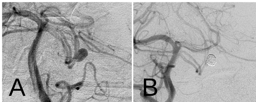
Fig. 3. AP projection digital angiography prior to (Panel A) and following embolization (Panel B).

cerebellar artery stenosis within the treatment volume and no evidence of ischemia or stroke [13]. In two reports detailing results of microvascular decompression for recurrence of pain following radiosurgery, no aneurysmal dilatations were seen in over 70 patients reported [14,15], although varying degrees of arachnoid thickening, adhesions and atherosclerotic changes were seen.