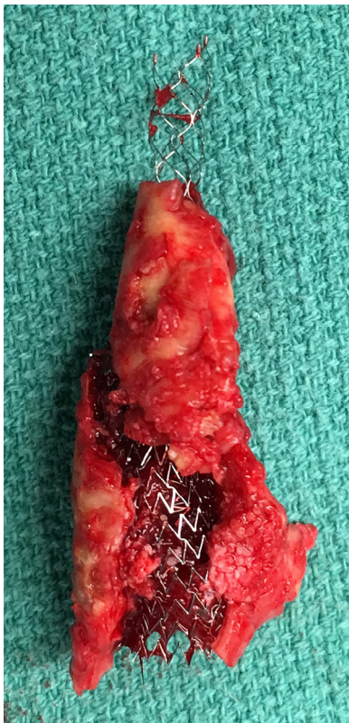
Figure 3. Gross specimen of the Solitaire stent, Precise carotid stent, and calcified atherosclerotic plaque.

As the incision and dissection extended rostrally, the retained Solitaire stent was identified inside the carotid stent. With the ICA unclipped and backbleeding, the entire plaque and stent mass was carefully removed caudally en bloc through the native non-stent area (Fig 3). Careful evaluation of the ICA was performed to rule out a dissection flap. Further dissection under heparinized saline irrigation occurred with a ringed curette to fine comb additional atherosclerotic plaque away from the intimal walls. Running sutures with a 6-0 prolene were used to close the endarterectomy from rostral to caudal direction. Before