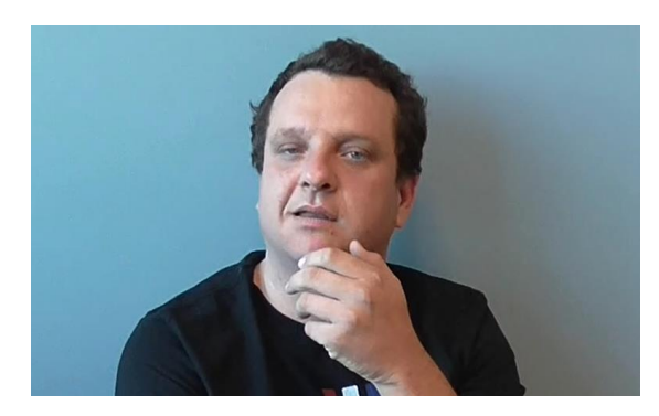
Still photograph of the patient

(sensory trick). He has mild involuntary closure of eyes. The cervical dystonia was increased during walking.