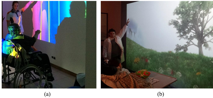
Figure 2. Semi-immersive virtual training with (2a) and without (2b) shadow (S-IVT_s) in BTS NIRVANA system.

search in the near space, repeated several times a week (Newport & Schenk, 2012). Contrarily, for USN rehabilitation, the use of moving stimuli seem to be crucial to modulate visual attention and drive attention to the left side of the space, thereby improving target detection in a specific area (Cipresso, Serino, Pedrol, Gaggioli, & Riva, 2014; Kerkhoff, 2003).