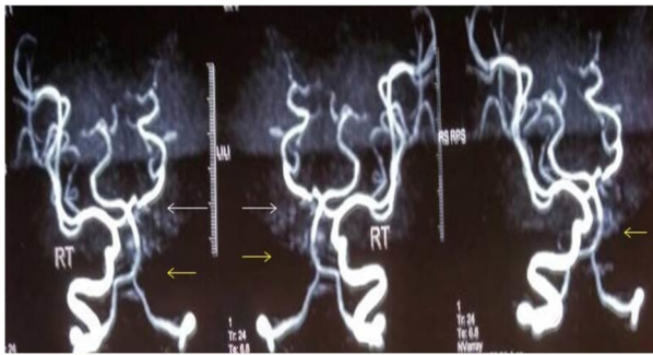
Non-visualisation of left internal carotid artery (yellow arrow) and left middle cerebral artery (white arrow)