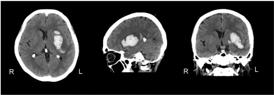
Figure 2. Head computed tomography (CT) scanning performed 2 days after onset.

Our patient scored 83% (25/30) for high-familiarity Kanji words and 90% (27/30) for high-familiarity Kana words. The repetition scores using the same stimuli for SCTAW and TLPA were 96% (43/45) and 93% (37/40), respectively. For the SLTA, she scored 35% (7/20) on picture naming, 90% (9/10) on word repetition, and 20% (1/5) on sentence repetition. Moreover, she could not correctly answer any of the spelling tasks in the SLTA. All of the results for the SLTA are summarized in Table 1.