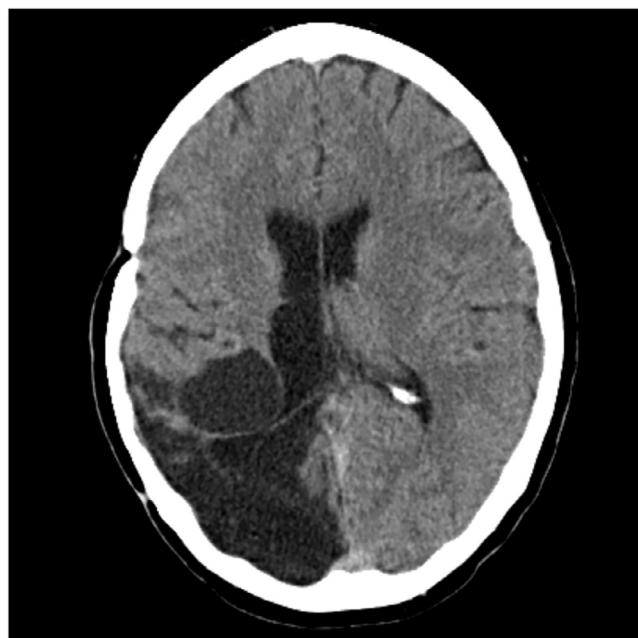
Fig. 1. Right Posterior Cerebral Artery Stroke Axial head CT without contrast obtained 6 years after neurosurgical clipping of right posterior cerebral artery (PCA) showing diffuse hypodensity and encephalomalacia in the right PCA vascular territory.

The patient underwent right-sided DBS lead (model 3391, Medtronic, Minneapolis, MN) implantation in the VC/VS for pain and right-sided GPi lead (model 3387, Medtronic, Minneapolis, MN) implantation for dystonia. The GPi target was chosen based on the extensive literature showing improvements of focal and generalized dystonia with GPi DBS [6]. VC/VS was selected based on reports of improved pain [7] and depression [8]. Our center has considerable experience with GPi targeting for the treatments of