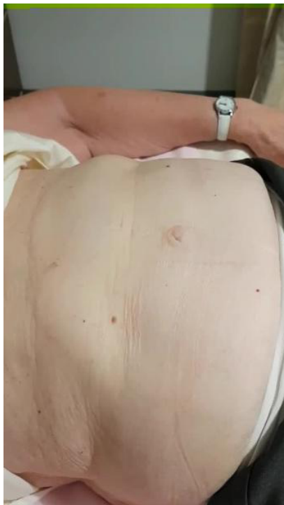
Video 1 Video showing the variable, irregular and predominantly right-sided abdominal movements.

diaphragm'. Van Leeuwenhoek's doctor attributed the symptoms to a palpitation of the heart. The empirically minded van Leeuwenhoek dismissed this view, as on feeling his pulse during an attack he 'did not feel any acceleration'. He self-medicated with port wine and nutmeg with limited effect and continued to suffer. 1 Even on his deathbed in August 1723, he