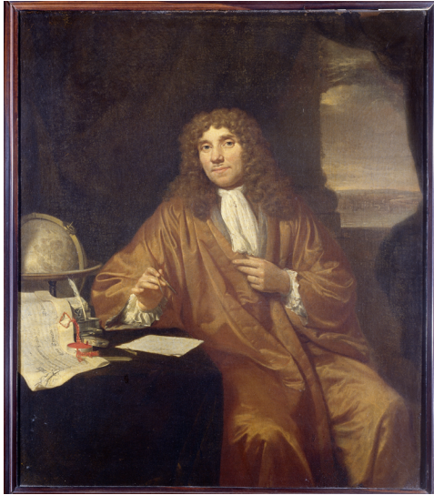
Figure 1 Portrait of Antonie van Leeuwenhoek (1632–1723) sitting at a writing desk. At his side, one can see a record of his appointment as a member of the Royal Society of Physicians of London. Painter: Jan Verkolje (1680–1686). Exhibited at the Rijksmuseum Amsterdam.

diaphragm'. Van Leeuwenhoek's doctor attributed the symptoms to a palpitation of the heart. The empirically minded van Leeuwenhoek dismissed this view, as on feeling his pulse during an attack he 'did not feel any acceleration'. He self-medicated with port wine and nutmeg with limited effect and continued to suffer. 1 Even on his deathbed in August 1723, he