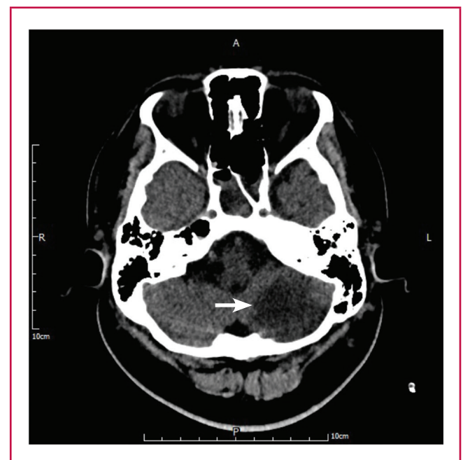
Fig. 2. Hypodense defect indicates acute left cerebellar infarction (white arrow).

When the left ventricular ejection fraction was approximately 50%, the Bi-VAD was weaned (right-VAD: 0.5 l/min; left-VAD: 0.8 l/min). The patient underwent successful Bi-VAD removal,