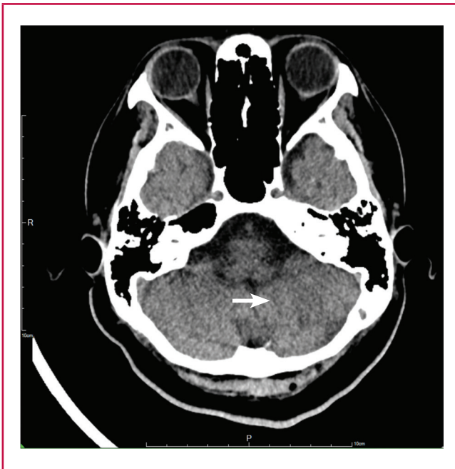
Fig. 3. The initial hypodense lesion progressed to chronic encephalomalacia of the left cerebellum (white arrow).

after a total of 18 days on Levitronix® haemodynamic support. One week later, a tracheostomy was performed, and the patient was weaned from the ventilator a week later. The follow-up CT showed chronic encephalomalacia of the left cerebellum (Fig. 3).