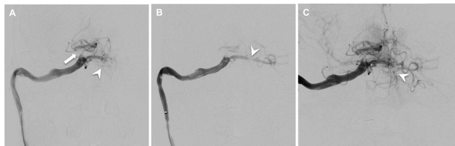
Figure 2 Thrombectomy. (A) Lateral DSA showed that the graft was largely patent, despite slow filling. However, there was absent filling of the basilar artery ( white arrowhead ), as well as occlusion of the more distal PCA ( white arrow ). (B) A Solitaire stent was deployed across the occlusion at the top of the basilar ( white arrowhead ). (C) Lateral DSA after two rounds of mechanical thrombectomy demonstrated flow through the basilar ( white arrowhead ), as well as collateral vessels to the distal PCA. Perfusion of the bilateral superior cerebellar arteries (SCA) is also seen off of the reperfused basilar artery.

The patient tolerated the procedure well, and her neurologic exam improved in the immediate postoperative period with mild