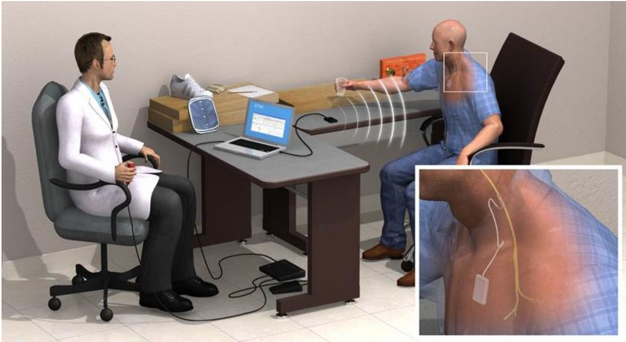
Figure 1. Implanted device allows brief bursts of vagus nerve stimulation to be delivered at precisely at the moment of individual motor training events (in a previous study) or during tactile sensory stimulation events (in the current study).