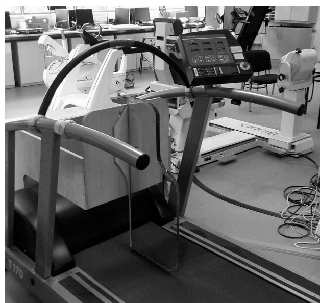
Figure 2. Hand rail locations on treadmill.

The participant verbally guided the speed of the treadmill at the beginning of each of the 12 therapy sessions, which was adjusted by the therapist. A COSMED h/p/cosmos T170 treadmill was used for the intervention. The participant was encouraged to walk at her comfortable walking velocity when on the treadmill. Treadmill velocity in session one was guided by baseline data from the 10MWT, which provided an average comfortable walking velocity in meters per second. For safety and because no weight bearing harness was employed during the intervention, the participant was advised to use the treadmill handrails for support when required. There was a stationary handrail in front of the participant where individual hands or both hands could be