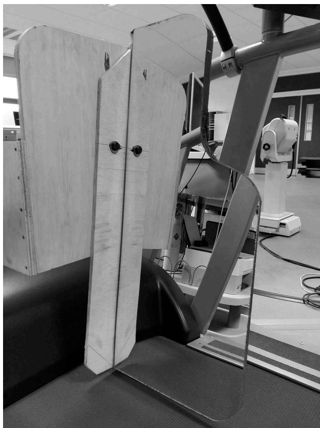
Figure 3. Mirror therapy apparatus for treadmill.

The participant walked on the treadmill while viewing a reflection of her non-paretic limb in a custom built acrylic mirror apparatus (Figure 3), positioned in the mid-sagittal plane between the legs that provided a full view of non-paretic leg movement, both in rear and forward positions. The angle of the mirror was then adjusted according to participant preference to gain a full view of the non-affected limb. Treadmill velocity was increased or decreased according to clinician judgment and participant tolerance. Each session was divided into two 15-minute sessions with a 5-minute rest period between them. Additionally, according to the Borg RPE Scale comfortable exertion occurs at 13/14 and the participant was asked to let it be known if she experienced feelings of 'very hard' while walking