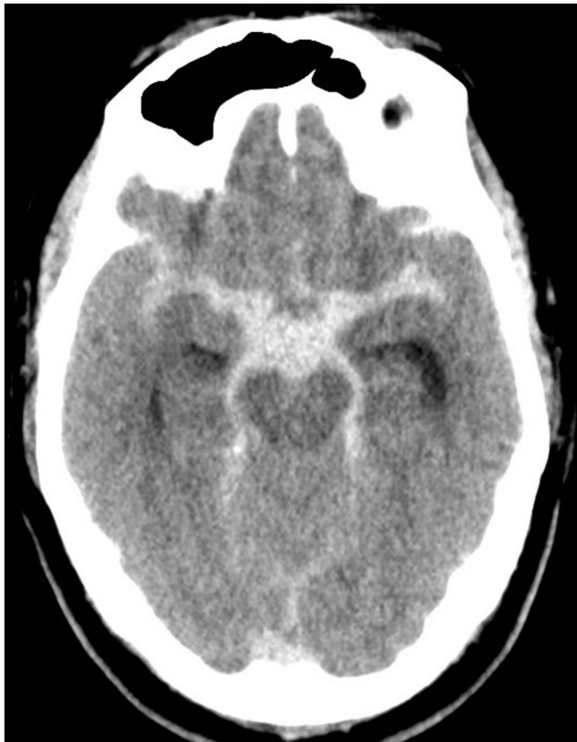
Figure 1 Head CT showing diffuse basal cisterns subarachnoid haemorrhage with third and fourth ventricular haemorrhage (Fisher grade 4).