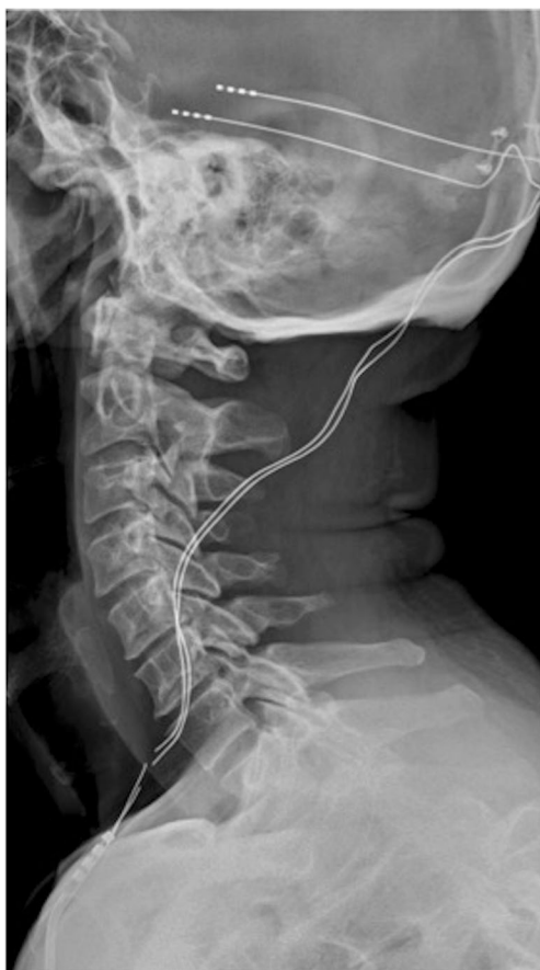
Fig. 3 Sagittal X-ray confirming the fracture and the stretching of the implanted electrodes