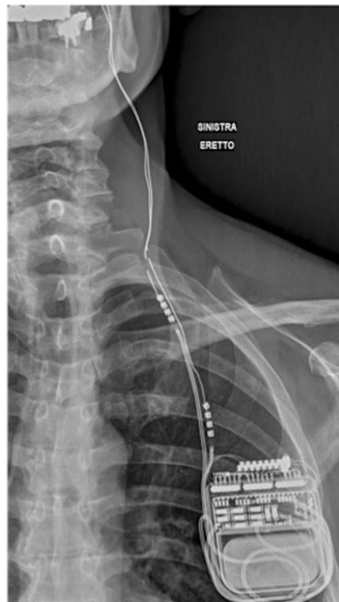
Fig. 2 Coronal X-ray confirming the fracture and the stretching of the implanted electrodes

had a severe bladder infection with high fever that induced a generalized tonic-clonic seizure with fall and consequently fracture of the right electrode and stretching of both extensions. After this episode, the patient experienced only 3 minor episodes that lasted up to 1 min without loss of consciousness. In January 2015, a bronchopneumonia induced a second generalized seizure with subsequent fall and fracture of the left implanted electrode, confirmed by impedance measurement, cranial and neck X-ray (Figs. 2 and 3). The post-traumatic CT scan did not show any kind of contusive or hemorrhagic brain damages (Fig. 4). Secondary to the low frequency of epileptic symptoms, we decided a wait-and-see solution. After 2 months, the patient presented a new generalized seizure. We newly decided to wait-and-see and eventually propose a surgical solution in case of epileptic recurrence. After the posttraumatic total disconnection of the DBS system, the patient reported no major seizure (Fig. 5). The EEG presented the absence of great pathological aspects except for few spikes and some bilateral slow waves. At present, at 5 years from the surgery, the patient describes only minor dizziness sensation at the awakening. The most recent neuropsychological evaluation showed a QIv at 74, a QIp at 82 and a QIt at 75.