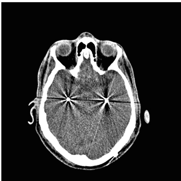
Fig. 4 Axial reconstruction of post traumatic CT scan, showing the absence of contusive or hemorrhagic brain damages