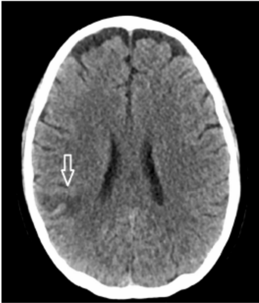
Fig. 1 Computed tomography image, axial slice through the lateral ventricles. The arrow shows a small, hyperdense hemorrhage, juxtacortical in the right parietal lobe. Perilesional edema is visible as a surrounding hypodense rim