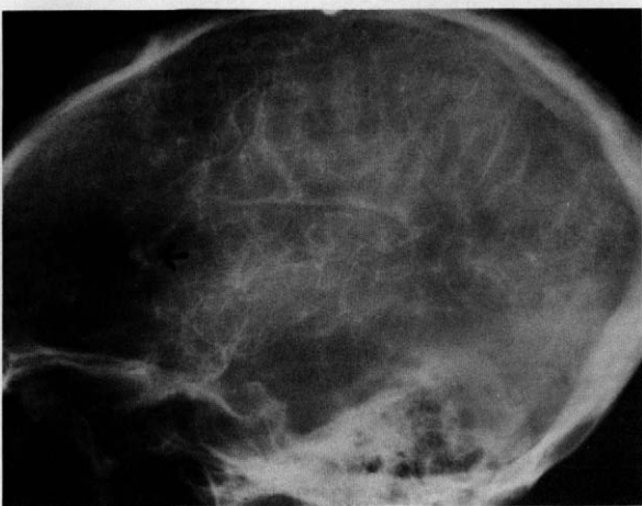
FIG. 4. Left carotid angiography, early venous phase. The aneurysm is still clearly visible (arrow), demonstrating a delayed emptying of the sac.

After the operation, he has been periodically followed in the neurology clinic and for the last two years has continued to do well. He has occasional tonic-clonic seizures, mostly during sleep, for which he is treated with phenytoin.