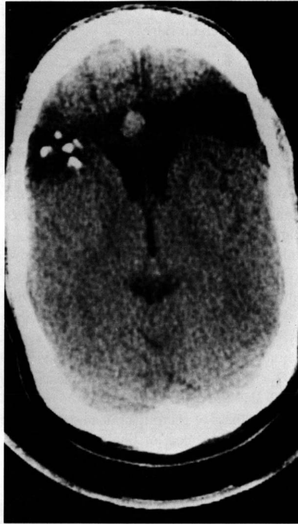
FIG. 1. CT scan of the head shows a round, contrast-enhancing lesion in the midline, anterior to the frontal horns. The lesion is located in the bullet trajectory across the frontal lobes. There are several scattered bone fragments on the right side.

aspect of both frontal lobes. In the right frontal lobe multiple tiny high-density areas were seen, which most likely represented scattered bony fragments.