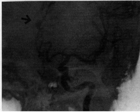
FIG. 3. Left carotid angiography, anteroposterior view. The aneurysm (arrow) has no neck, and it is not located at a branching point.

He underwent a right frontal craniotomy and aneurysmectomy. Temporary clips were placed on the left pericallosal artery, proximal and distal to the aneurysmal dome. The aneurysmal sac was then completely excised and the free edges were oversewn to reconstitute blood flow along the artery. A clip was placed around the surgical repair.