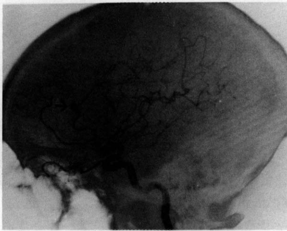
FIG. 2. Left carotid angiography, lateral view. An irregularly shaped aneurysm is visible in the pericallosal artery (arrow).