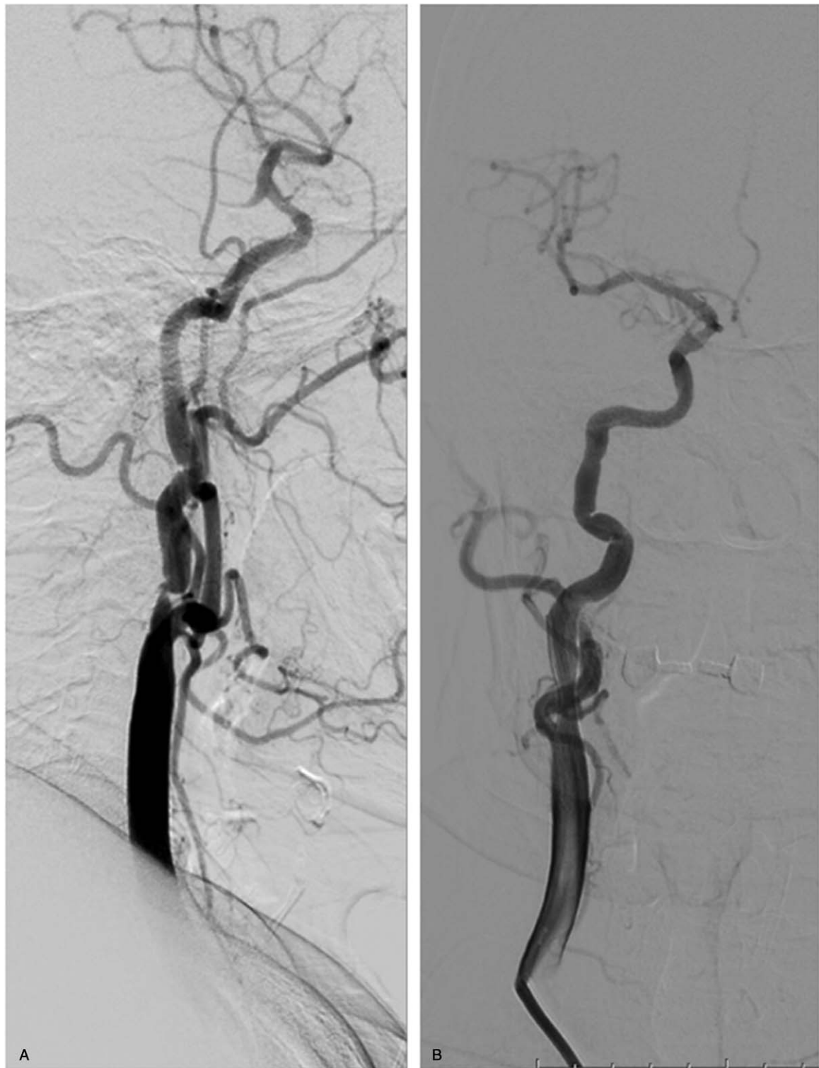
Figure 2. A. Angiography before stent placement demonstrates 95% stenosis before carotid artery stenting (CAS) placement. B. Angiography demonstrates nearly total resolution of the stenosis after CAS placement.

reason for her ICH. The patient had basal ganglia hemorrhage and thalamic hemorrhage. Although both have different blood supplies, hypertension is the leading cause of these hemorrhages. [16] Abou-Chebl et al [13] reported that the incidence of CHS and ICH can be reduced with stringent BP control; thus, in our case, the ICH may be attributed to hypertension.