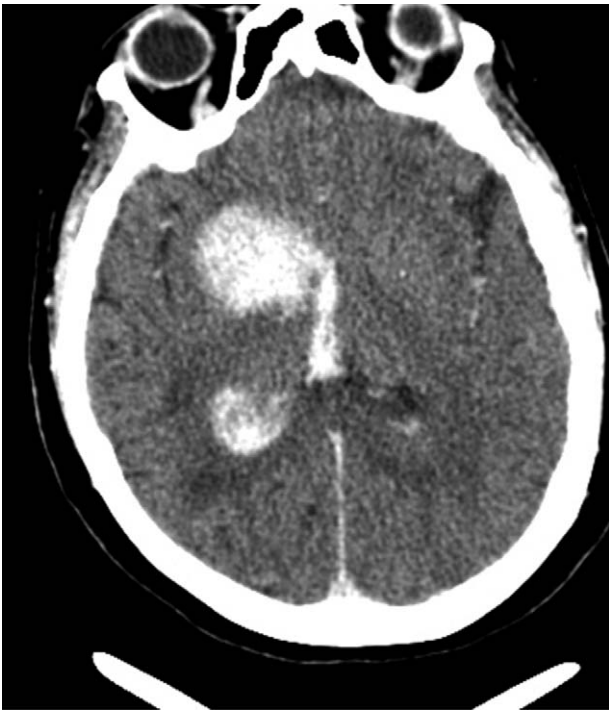
Figure 3. Cerebral hemorrhage seen in the right basal ganglia immediately after revascularization.

long-term cerebral ischemia, low resistance is observed in the cerebral circulatory system, the brain tissue may lack effective protection by cerebrovascular self-regulation, and the normal BP may cause severe damage to the cerebral blood vessels. Thus,