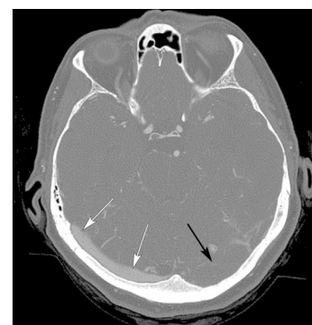
Figure 2 Brain CT venogram showing extensive filling defect left transverse sinus (black arrow). Normal right transverse sinus (white arrows).

The risk factors include inherited hypercoagulable states, trauma, infection, dehydration, pregnancy and puerperium, neoplastic invasion of cerebral venous sinuses, haematological disorders and use of oral contraceptive (OC) pills. Although iron deficiency anaemia (IDA) has been reported as a cause of CVT in several paediatric cases, this association is extremely rare. To our knowledge,