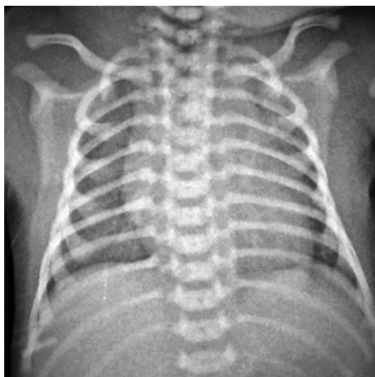
Figure 1 Chest X-ray showing cardiomegaly.