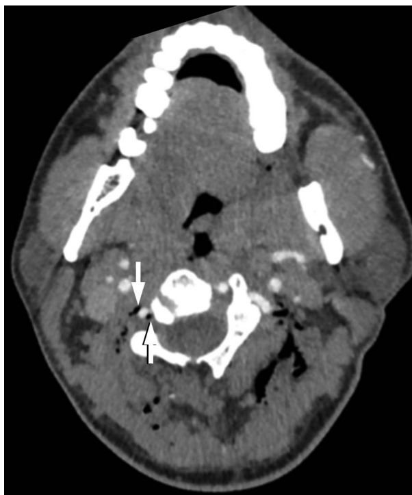
FIG. 1. Axial computed tomographic angiogram demonstrates multiple foci of gas in the paravertebral soft tissue. There are 2 foci of gas (arrows) adjacent to the right vertebral artery.