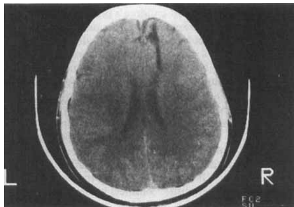
Figure 1: Computerised tomographic (CT) scan shows the linear non-enhancing lesion in the right medial frontal lobe and right fronto-polar cortical atrophy.

The exact mechanism of ipsilateral seizures is poorly understood, although various hypotheses have been put