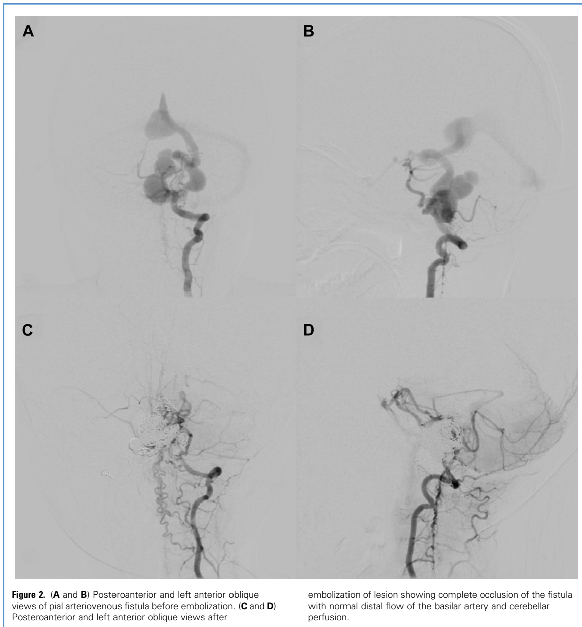
Figure 2. (A and B) Posteroanterior and left anterior oblique views of pial arteriovenous fistula before embolization. (C and D) Posteroanterior and left anterior oblique views after

embolization of lesion showing complete occlusion of the fistula with normal distal flow of the basilar artery and cerebellar perfusion.