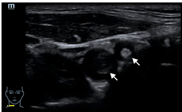
Figure 1. Ultrasonography of the carotid vessels, showing solid echoes in the internal (left arrow) and external (right arrow) carotid arteries.