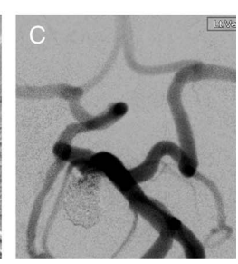
FIGURE 1. Posteroanterior view of a digital subtraction angiogram of the left vertebral artery (A) demonstrates large posterior cerebral arteries feeding the bilateral anterior circulation due to bilateral carotid artery occlusions. The etiology of the carotid occlusions was felt to likely be due to moyamoya disease. <sup>1–3</sup> Transporter function available from the <sup>131</sup>I-ioflupane (DAT) scan has provided an invaluable diagnostic tool to assist in distinguishing Parkinson disease from other possible etiologies associated with tremors. 4-7 One other previously reported DAT scan showed unilateral absence of caudate uptake in a patient with a hand tremor.8 The current case shows total unilateral absence of both caudate and putamen functions. Magnified caudally angulated view of the left vertebral artery (B, arrow) shows a recurrence of the previously coiled basilar tip aneurysm at the neck with a maximal dimension of 5 \times 3 millimeters. Such aneurysms are often associated with moyamoya disease. The aneurysm was successfully treated with 2 detachable coils (C).