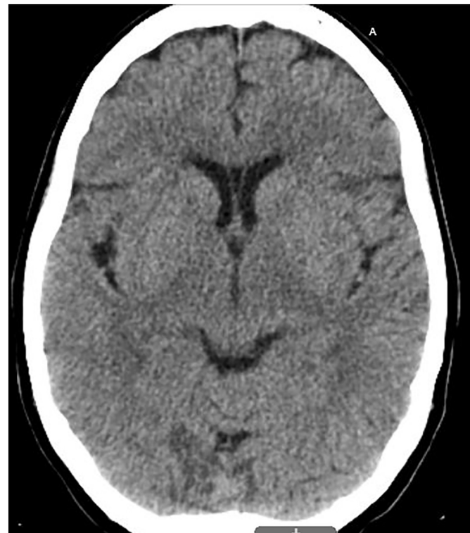
Fig. 1. Non-contrast head CT demonstrating nonspecific heterogeneous low-attenuation lesion within the medial right occipital lobe.

isolated manifestation) or a secondary delusional infestation (a delusion occurring secondary to a psychiatric disorder, substance use, or medical illness, as in this patient). Primary delusional parasitosis is often managed with an antipsychotic, whereas secondary delusional parasitosis is best managed by addressing the underlying cause.