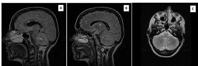
Figure 1 Fluid-attenuated inversion recovery (FLAIR) MRI at presentation. (A) FLAIR sagittal MRI showing white matter lesions in the corpus callosum (snowball lesions) and cerebellum lesion. (B) FLAIR sagittal MRI which shows the extension of the cerebellum lesion and the affection of the basal ganglia. (C) FLAIR axial MRI with a new view of the cerebellum lesion.

In conclusion, the patient experienced recovery from the neurological symptoms, as well as an improvement in neuropsychiatric symptoms; no further psychotic or dissociative episodes