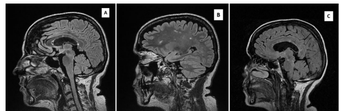
Figure 2 Fluid-attenuated inversion recovery sagittal MRI 1 month later at second (A,B) and third (C) hospitalisations. (A) The remaining lesions still including the characteristic lesions of the corpus callosum, although to a lesser extent than those shown on the first MRI. (B) Diffuse subcortical white and grey matter lesions. (C) New subcortical and pons and medulla oblongata junction T2 hyperintense lesions.