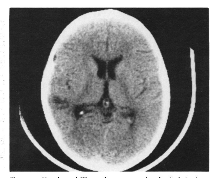
Figure 3. Unenhanced CT scan demonstrates a low density lesion in the right posterior temporal region.

It is unlikely that a pre-existing vascular malfor-