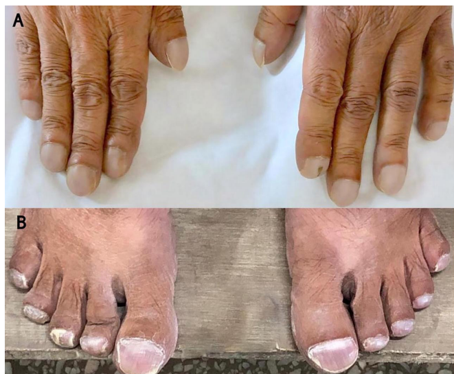
Figure 1 Grade 3 clubbing of (A) fingers and (B) toes.

Polycythaemia is defined as raised plasma red cell concentrations, with a haemoglobin level of >16.5 g/dL and haematocrit values of >48\% for women, or a haemoglobin level of >18.5 g/dL and haematocrit values of >52\% for men.