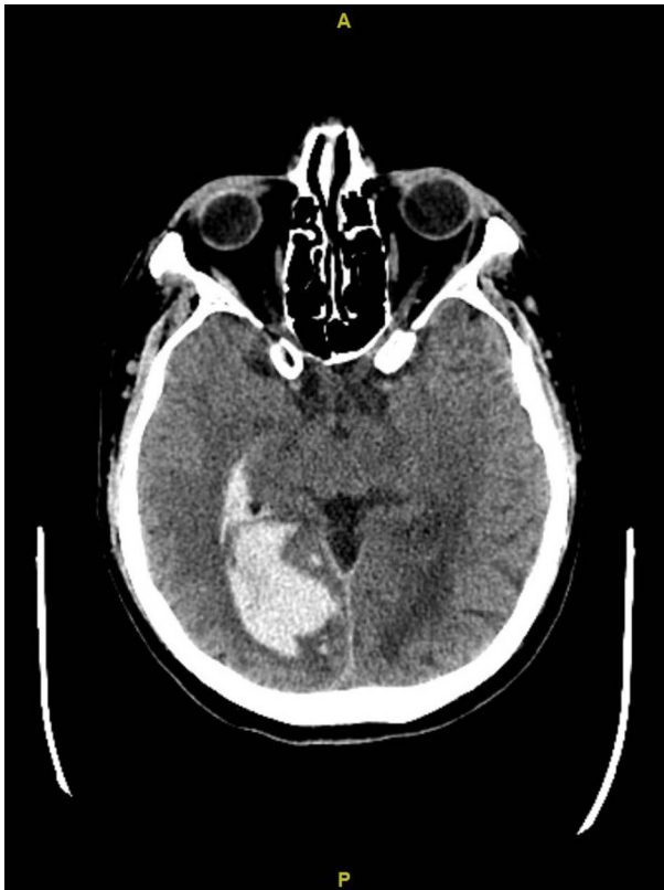
FIG. 2. Computed tomography (CT) scan of the brain shows the right parieto-occipital hemorrhage and the left occipital hypodense area.

a necrotizing ependymomyelitis (1,2,4). Clinicians should recognize the juxtaposed, crossed quadrant, homonymous quadrantanopia (the checkerboard visual field), understand the localizing value of the finding, and be aware that the bilateral visual pathway events may be simultaneous or sequential.