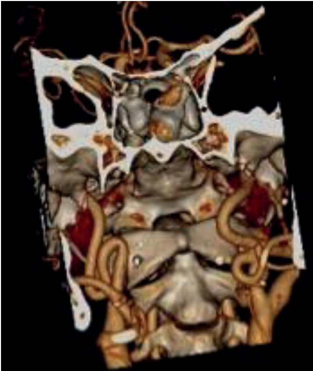
Figure 1. 3D Volume Rendering Technique (VRT)