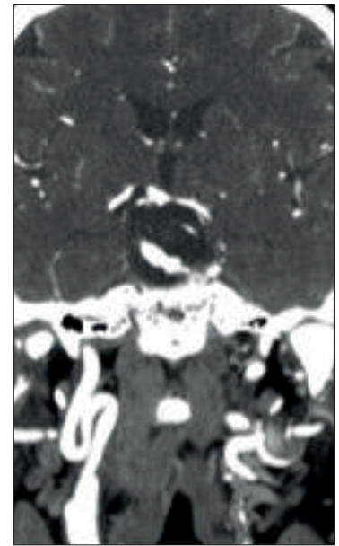
Figure 2. Maximum Intensity Projection–Bilateral Kinking ACI with right duplex Kinking verified

observed). Diagnostic transcranial Doppler (TCD) of verteobasilar artery showed decreased blood flow velocities in both vertebral and basilar artery and indicated atherosclerotic altered blood vessels of the brain (Figure 1). CTA findings indicate bilateral kinking of internal carotid artery with right duplex Kinking (Figure 2). SPECT with 15 mCi ^{99m}\text{Tc} -hexamethylpropyleneamineoxime ( ^{99m}\text{Tc} -HMPAO) verified global cortex hypoperfusion, indicating chronic vascular failure (Figure 3). The patient was treated with acetylsalicylic acid, clopidogrel, atorvastatin, donepezil, memantine, escitalopram, bromazepam, along with antihypertensive and antidiabetic therapy (per os).