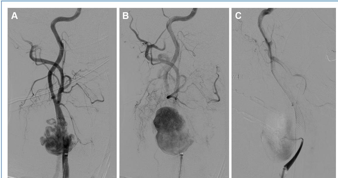
Figure 2. Right common carotid artery (CCA) angiography showing a giant neck pseudoaneurysm. (A) Early arterial phase. (B) Late arterial phase. (C) Occlusion of proximal CCA by balloon

guiding catheter revealed the fistula from just proximal of the carotid stent of CCA to the aneurysm.