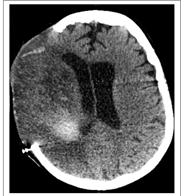
Figure 4. Head CTA axial section showing haemorrhagic transformation in the established infarct.

with neurological involvement. Although the high risk of mortality associated with a conservative approach is well recognised, the risk of mortality and complications as a result of intervention may potentially outweigh its benefits. Therefore, a risk-based approach that takes into account both surgeons' and patients' preferences is strongly recommended. In the case reported, a decision was made to immediately repair the AD as a potentially life-saving measure. However, other strategies may have been adopted at that stage, including delayed surgical repair and medical or conservative management.