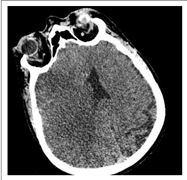
Figure 3. Head CT axial section with malignant MCA infarct but no mass effect.