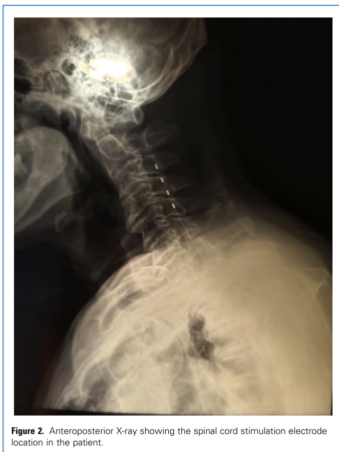
Figure 2. Anteroposterior X-ray showing the spinal cord stimulation electrode location in the patient.

We measured the therapeutic effectiveness of the stimulation using the Brief Pain