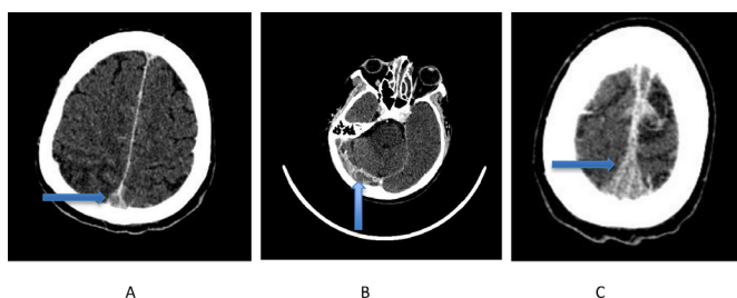
Figure 2 CT venogram images. (A) Empty delta sign suggestive of filling defect in the posterior part of the superior sagittal sinus post contrast administration. (B) Filling defect in the right transverse sinus and the right sigmoid sinus. (C) Filling defect involving the middle part of the superior sagittal sinus.

CVST is an uncommon condition. 3 The annual incidence in studies ranges between 1.32 and 1.57 per 100 000. 4,5 It is more common in the younger population and more prevalent in women than men. 3 CVST can present broadly as three clinical syndromes: isolated intracranial hypertension (headache,