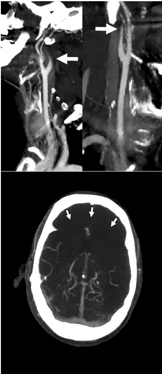
Fig. 1. CTA of the carotid arteries. On the upper left panel, maximum intensity projection (MIP) of the left carotid bifurcation is shown, on the upper right panel a MIP of the right carotid bifurcation. White arrows indicate decreased contrast opacification in the internal carotid arteries, the actual thrombus could not be visualized. In the lower panel an axial MIP of the circle of Willis. The arrows indicate near complete absence of vascular enhancement in the vascular territories of the anterior and part of the medial cerebral arteries due to diffuse arterial thrombosis.