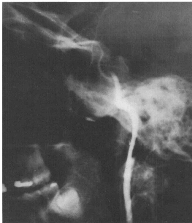
FIGURE 2. Left carotid angiogram in anteroposterior (left) and lateral (right) views showing occlusion of internal carotid artery at siphon level.